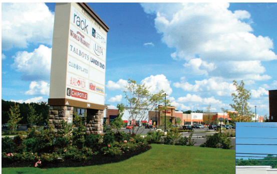
Chimney Rock Crossing East, Bridgewater