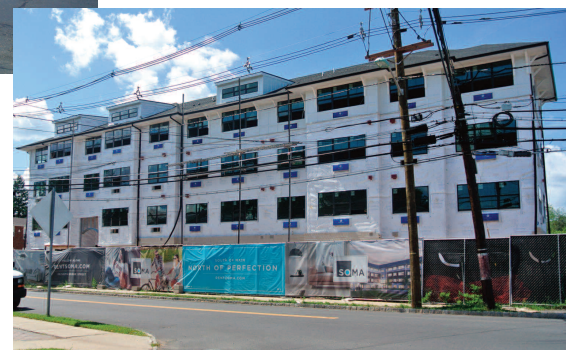
South of Main, Somerville