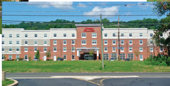
Hampton Inn, Bridgewater