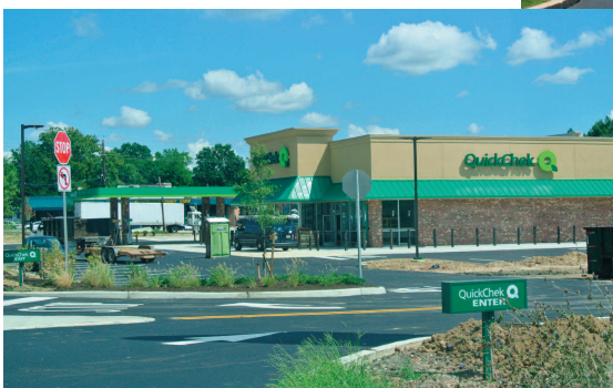
Quick Chek, Raritan