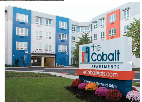
Cobalt Apartments Somerville

The Toolkit is a package of materials supporting efforts to attract and retain a talented workforce and address the universal competitiveness challenge. The content includes information that is important to prospective employees and visitors.