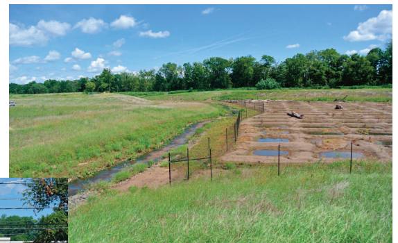
Landfill Green Seam, Somerville