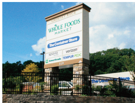
Chimney Rock Crossing West

AC Marriott Hotel, Somerset Corporate Center, Bridgewater Lifetime Fitness, Somerset Corporate Center, Bridgewater Hunterdon Healthcare, Route 22, Bridgewater Third Street Transit Oriented Development, Raritan QuickChek, Somerville Circle, Raritan Fortitude Fitness, West End Avenue, Raritan Green Seam Park, Landfill Site, Route 206, Somerville Wawa, Union Avenue (Route 28), Bridgewater