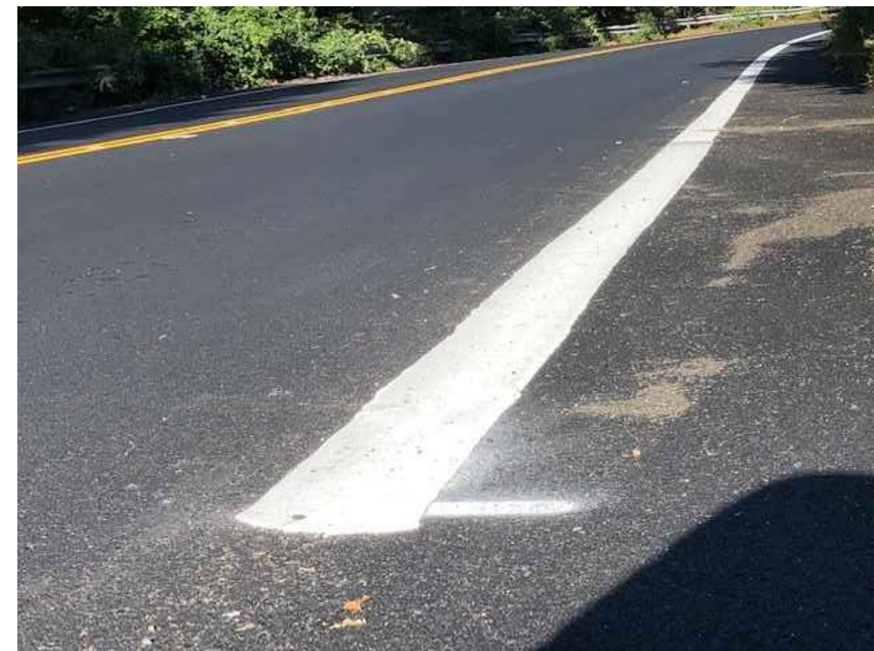
E. WIDENED 8" EDGELINE