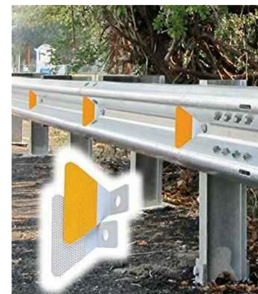
G. GUIDERAIL AND RETROREFLECTIVE DELINEATORS