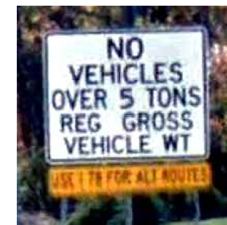
L. SUPPLEMENTAL TRUCK SIGNAGE