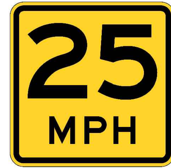
A. ENHANCED HORIZONTAL CURVE WARNING SIGNS