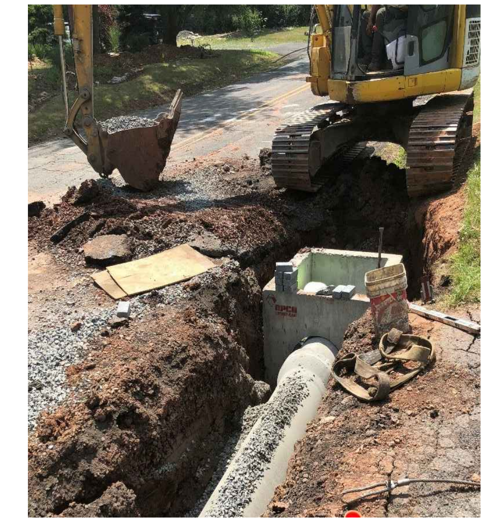
I. DRAINAGE IMPROVEMENTS