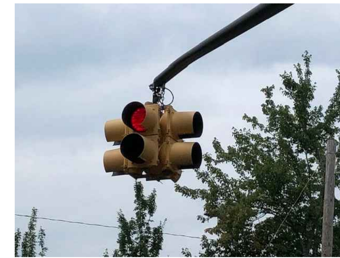
C. FLASHING BEACON WARNING LIGHT