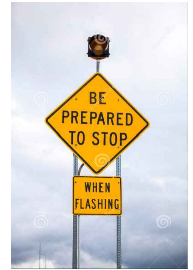
D. ITS TECHNOLOGY/DEVICES (QUEUE DETECTION SYSTEM)