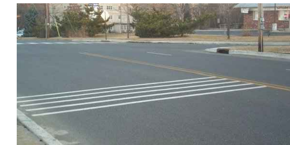
H. STRIPED RUMBLE STRIPS AND CENTER LINE RUMBLE STRIPS