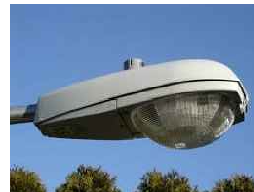
K. IMPROVED ROADWAY LIGHTING