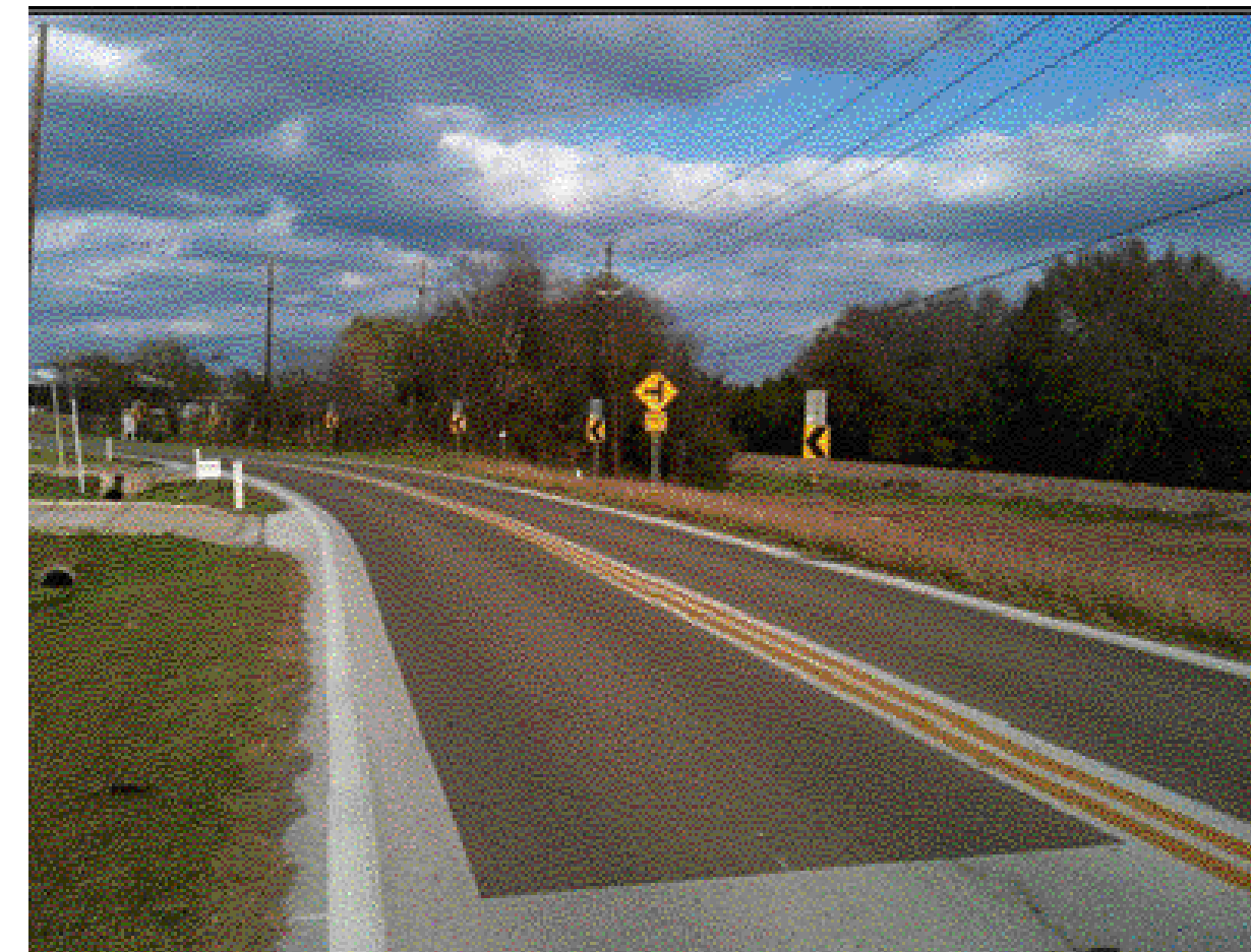
F. GROOVED PAVEMENT/ HIGH FRICTION SURFACE TREATMENT