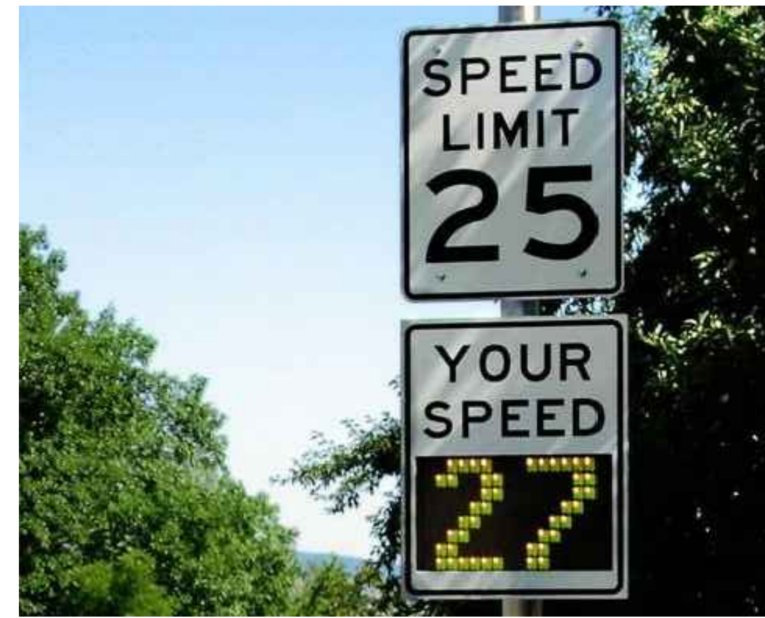
B. RADAR SPEED FEEDBACK SIGNS