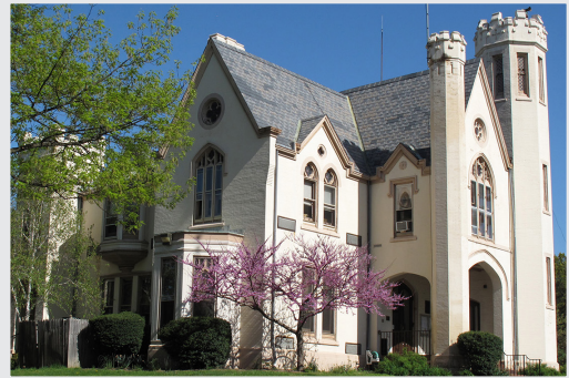
Somerville Borough Hall (The Roberts Mansion), Somerville

About: To advise, support and assist in planning for the promotion of the borough's significant historical resources; to educate the public about Somerville's historic character.