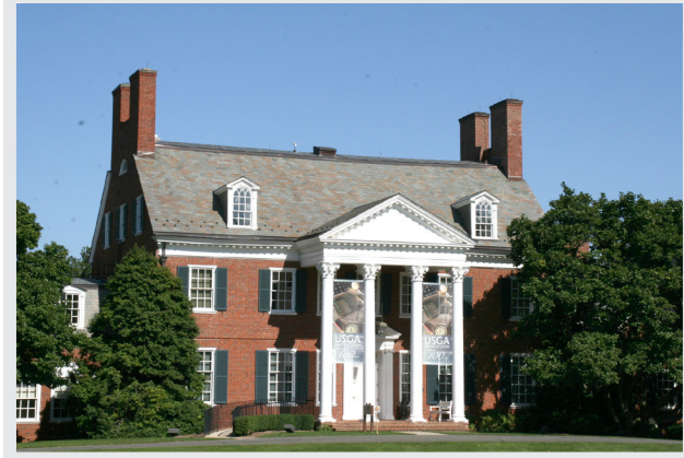
USGA Golf Museum, Liberty Corner

Website: https://www.usga.org/content/usga/home-page/usga-golf-museum.html