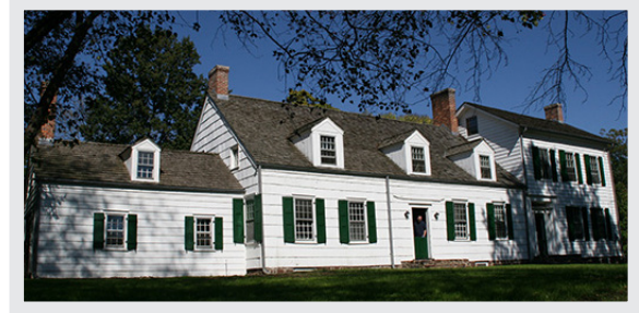
The Abraham Staats House,, Sotuh Bound Brook

House, Inc. is a historical, nonprofit organization that supports the ongoing restoration and preservation of properties directly related to the history of South Bound Brook with a primary focus on preservation of the Abraham Staats House, c. 1740 (listed on the National Register of Historic Places). The organization also works to instill community pride in our local history, is devoted to educating the public and promotes the historical interests of South Bound Brook and surrounding communities through numerous events, partnerships, programs and activities.