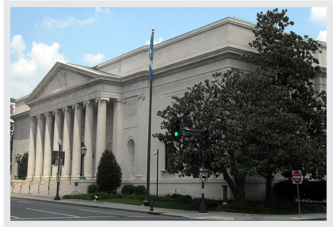
DAR Constitution Hall, Washington, DC

About: A nonprofit, women's genealogical and educational organization which promotes American history, patriotism, historic preservation and to honor the patriots of the Revolutionary War.