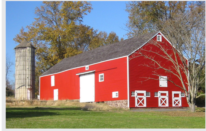
Kennedy Martin-Stelle English Barn, Bernards

part of the state of New Jersey, is to enrich the lives of the public by preserving the historical record and advancing interest in and awareness of New Jersey's past. The Commission provides grants to historical organizations for general operating support, and various projects including archival services, educational materials for teachers, and publishes the Journal of New Jersey History.