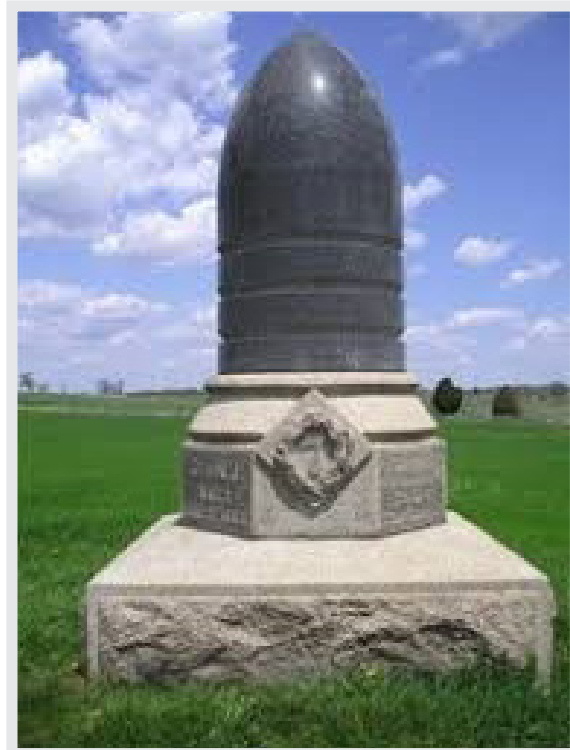
7th New Jersey Volunteer Infantry Monument, Gettysburg NHP

About: The Sons of Union Veterans of the Civil War (SUVCW) is a nonprofit, patriotic, genealogical, historical, and fraternal organization dedicated to preserving the history and legacy of veteran heroes who fought and worked to save the Union in the American Civil War. Organized in 1881 and chartered by Congress in 1954, SUVCW is the legal heir and successor to the Grand Army of the Republic.