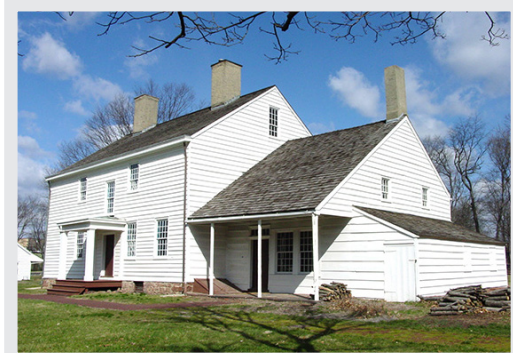
Wallace House, Somerville

About: The State Park Service with the nonprofit Wallace House and Old Dutch Parsonage Association preserves and interprets Gen. George Washington's 1778-79 Revolutionary War winter headquarters and the historic home of the founder and first president of Rutgers, the State University of New Jersey at Wallace House & Old Dutch Parsonage State Historic Sites.