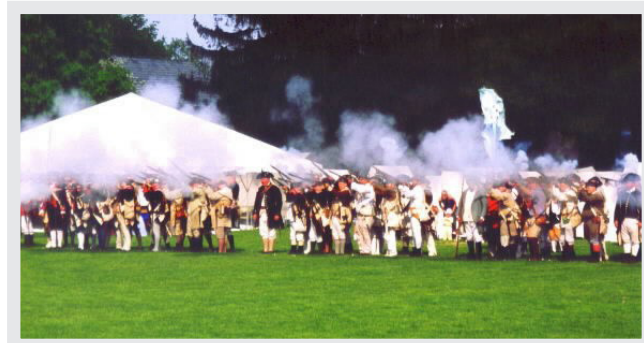
Revolutionary War Reenactment, Bound Brook

About: A patriotic, nonprofit that serves to preserve the principles of freedom and good government for which our forefathers fought on behalf of succeeding generations.