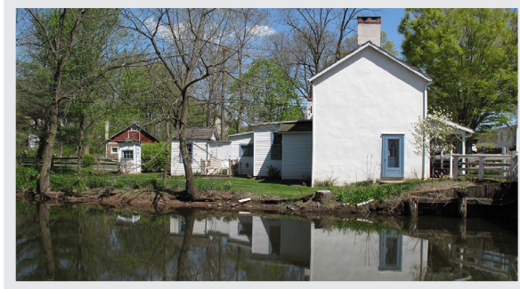
Delaware & Raritan Canal, Griggstown

About: To provide and maintain the recreational facilities associated with the D & R Canal and to educate the public about the natural and historic resources of the Canal.