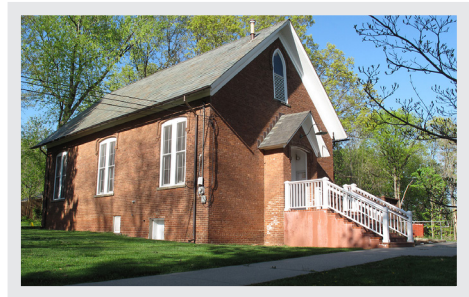
Millstone Borough Hall, Millstone