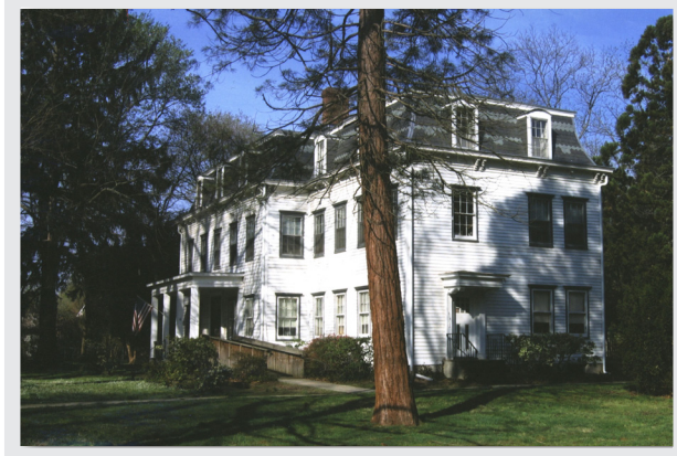
Vermeule Mansion, North Plainfield

About: A volunteer, nonprofit heritage and historic preservation community organization that strives to preserve, renovate, and promote the use of the Vermeule Mansion, and to promote, expand, and supervise its use. The mansion is owned by the Borough of North Plaineld, and is listed in the State and National Registers of Historic Places.