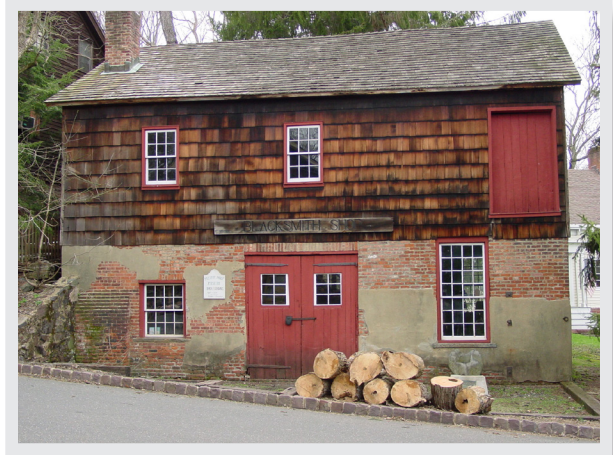
The Old Millstone Forge, Millstone

About: A historical, educational, nonprofit that strives to maintain a restored 18th century blacksmith's shop, available to the public as a museum. The blacksmith shop is listed on the National Register of Historic Places as part of the Millstone Historic District.