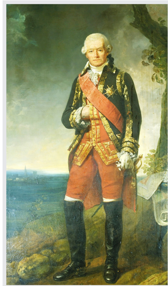
Jean-Baptiste Donatien de Vimeur, comte de Rochambeau

About: A historical, nonprofit organization that serves to promote, preserve and commemorate the march of French and allied forces through New Jersey during the American Revolution. The route has been designated a National Historic Trail see Washington-Rochambeau Revolutionary Route National Historic Trail (U. S. National Park Service) and www.W3R-US.org .