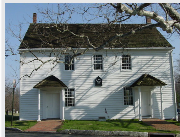
Mount Bethel Baptist Meeting House, Warren

Meetings: On the 2nd Thursday of every month at 7:30 p.m.; except July and August. Please consult the Township calendar for location of each meeting ( http://warrennj.org/calendar/ ). Meetings are open to the public.