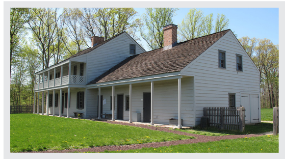
Rockingham State Historic Site, Kingston

About: Rockingham State Historic Site is interpreted as the Berrien family farmstead which served as Gen. George Washington's final wartime headquarters in the latter half of 1783 while Congress met nearby in Princeton and where he wrote his "Farewell Orders to the Armies" just before receiving news that the definitive Treaty ending the Revolutionary War was signed.