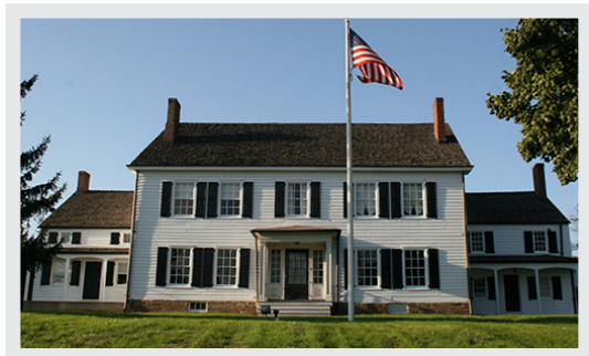
The Van Horne House, Bridgewater

About: The Heritage Trail Association (HTA) is the “Hub for the History and Culture of Somerset County and NJ”, a nonprofit, historic organization dedicated to creatively celebrating and educating the public about New Jersey’s role in our nation’s history, connecting people to history through innovative, creative and engaging history programming.