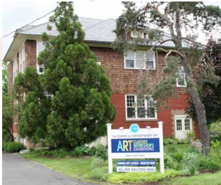
The Center for Contemporary Art

The Center is committed to broadening, deepening, and diversifying participation among audiences; to challenging and inspiring students, teachers, artists, enthusiasts and members of the community through the many facets of the visual arts; and to creating a culture of the highest standards and expectations for artistic exploration, interpretation and perception. The Center presents rotating exhibitions of contemporary art, provides exhibition opportunities for members, and hosts Youth Art Month exhibitions for Somerset County. Outreach programs bring vital art experiences to underserved populations such as children with Autism Spectrum Disorder and other special needs, adults with disabilities, homeless teens in recovery, seniors and adults affected by cancer.