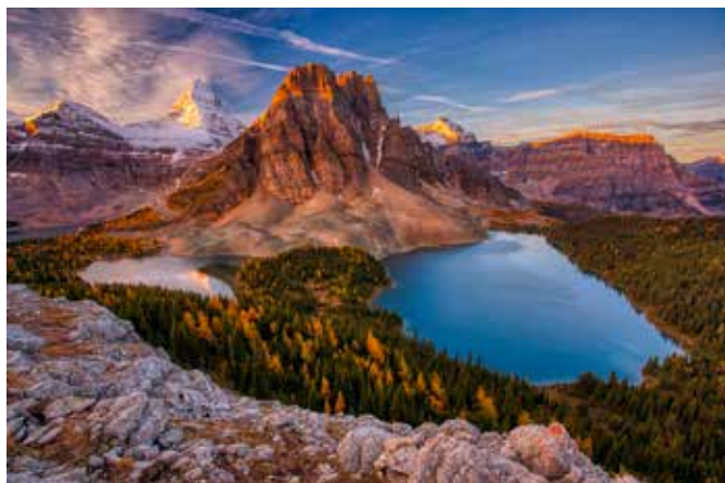
Sunrise, Assiniboine Provincial Park

About: A private, non-profit, that promotes interest in and appreciation of, nature through the medium of photography. This group also engages in photography lectures; field trips; occasional exhibitions; contests; education and service projects to aid environmental group.