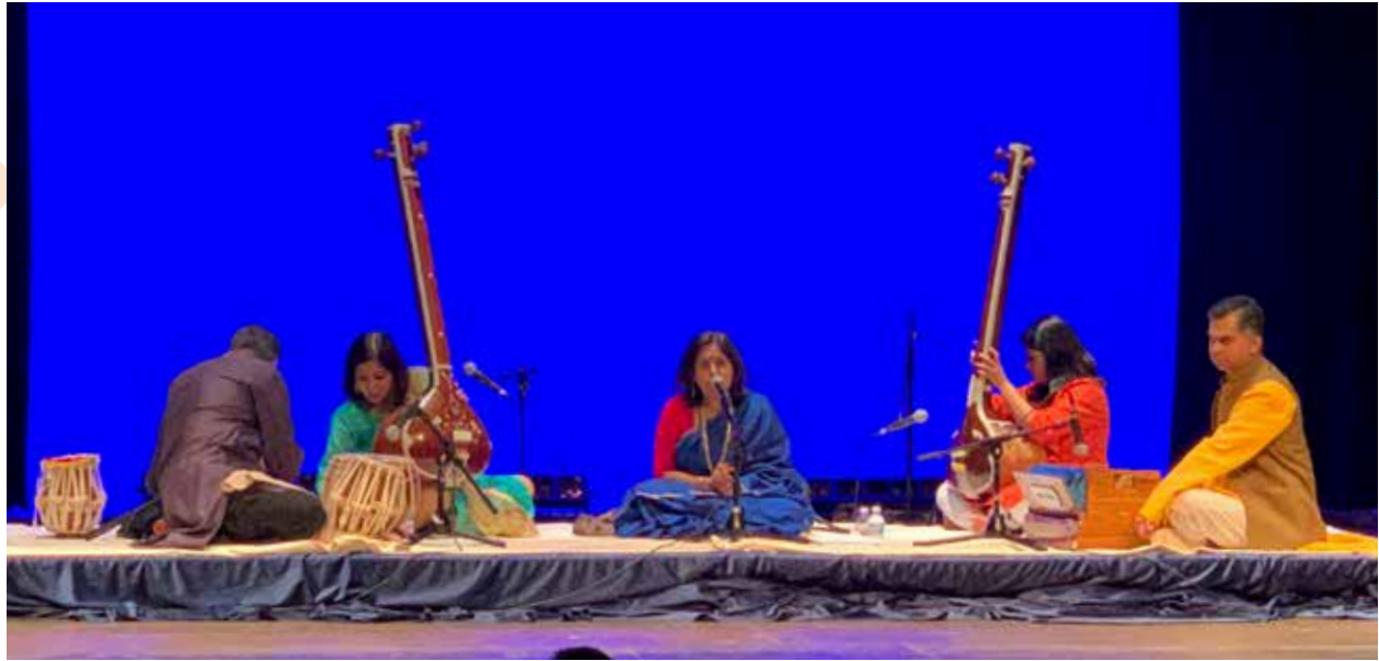
A Night of Hindustani Music at Villagers Theatre