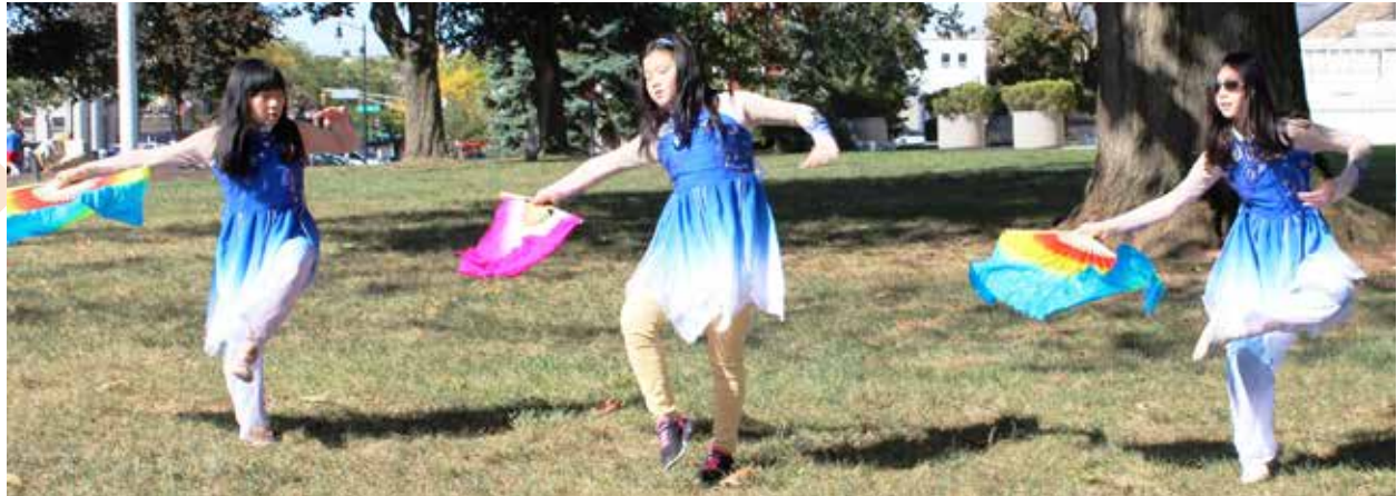
Somerset County 4-H Chinese Culture Club, 2019 Diversity Festival