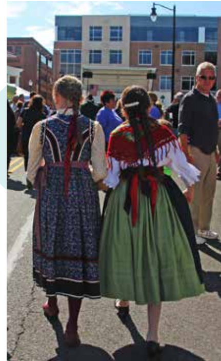
Hungarian Dancers 2019 Diversity Festival

About: A registered 401(c) organization which serves to foster the ideals, and cultivate the history and traditions of the Irish; to promote friendship, unity and Christian charity amongst members; and to uphold and sustain loyalty to the United States of America. Meetings are normally held on the third Tuesday of each month in the Somerville Knights of Columbus on E. Main Street.