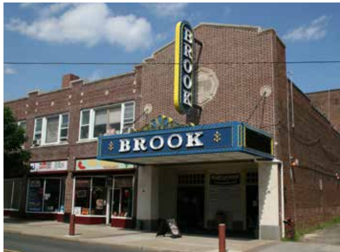
The Brook Arts Center, Bound Brook, NJ

About: The Somerset County Cultural Arts Center, Inc, is a private, non-profit, which is committed to cultivating the arts in Somerset County by creating a performance arts center at the Historic Brook Theater in Bound Brook, NJ that will provide high quality live performances, art, music, and films to our diverse community; will inspire creativity, learning and growth through the Performing Arts; and will foster community partnerships and educational programs.