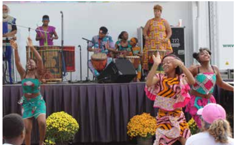
Universal African Dance & Drum 2019 Diversity Festival

About: Non-profit organization addressing educational, cultural and health issues as they relate to the African-American community.