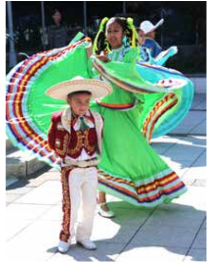
Xochiquetzal Mexican Dance Troupe 2019 Diversity Festival

About: A private, non-profit, organization that strives for greater awareness and respect for all people in our community.