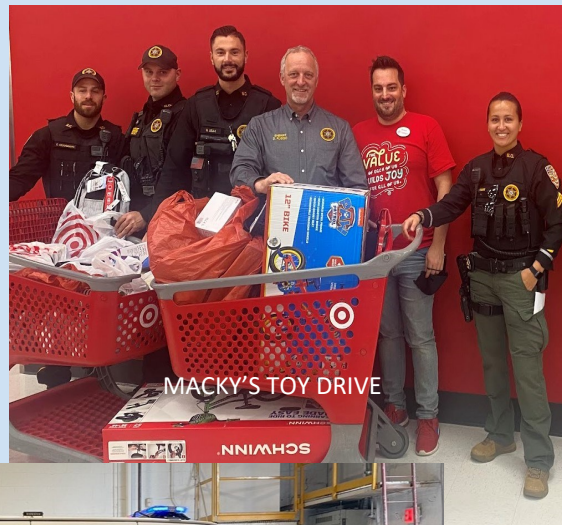
MACKY'S TOY DRIVE