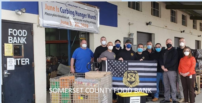
SOMERSET COUNTY FOOD BANK

Working together for the community PBA Local 177 & 272 have helped make our outreach programs a huge success by donating their time and funds. These photos are just a few examples of what they have accomplished.