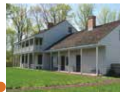
Rockingham Historic Site Gen. George Washington's final wartime headquarters. 84 Laurel Avenue Franklin, NJ 08528