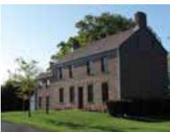
Van Veghten House Quartermaster Gen. Nathanael Greene stayed here. 9 Van Veghten Drive Bridgewater, NJ 08807