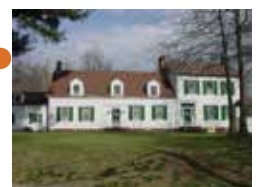
Abraham Staats House Inspector Gen. Baron von Steuben stayed here. 17 Von Steuben Lane South Bound Brook, NJ 08880

FIVE GENERALS GEOCACHING A History Scavenger Hunt