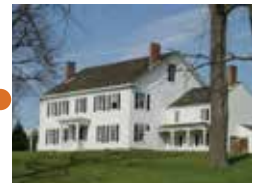
Philip Van Horne House Gen. William Alexander, Lord Stirling stayed here. 941 East Main Street Bridgewater, NJ 08807