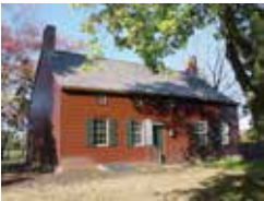
Jacobus Vanderveer House Gen. Henry Knox stayed here. 3055 River Road Bedminster, NJ 07921 Located in River Road Park.