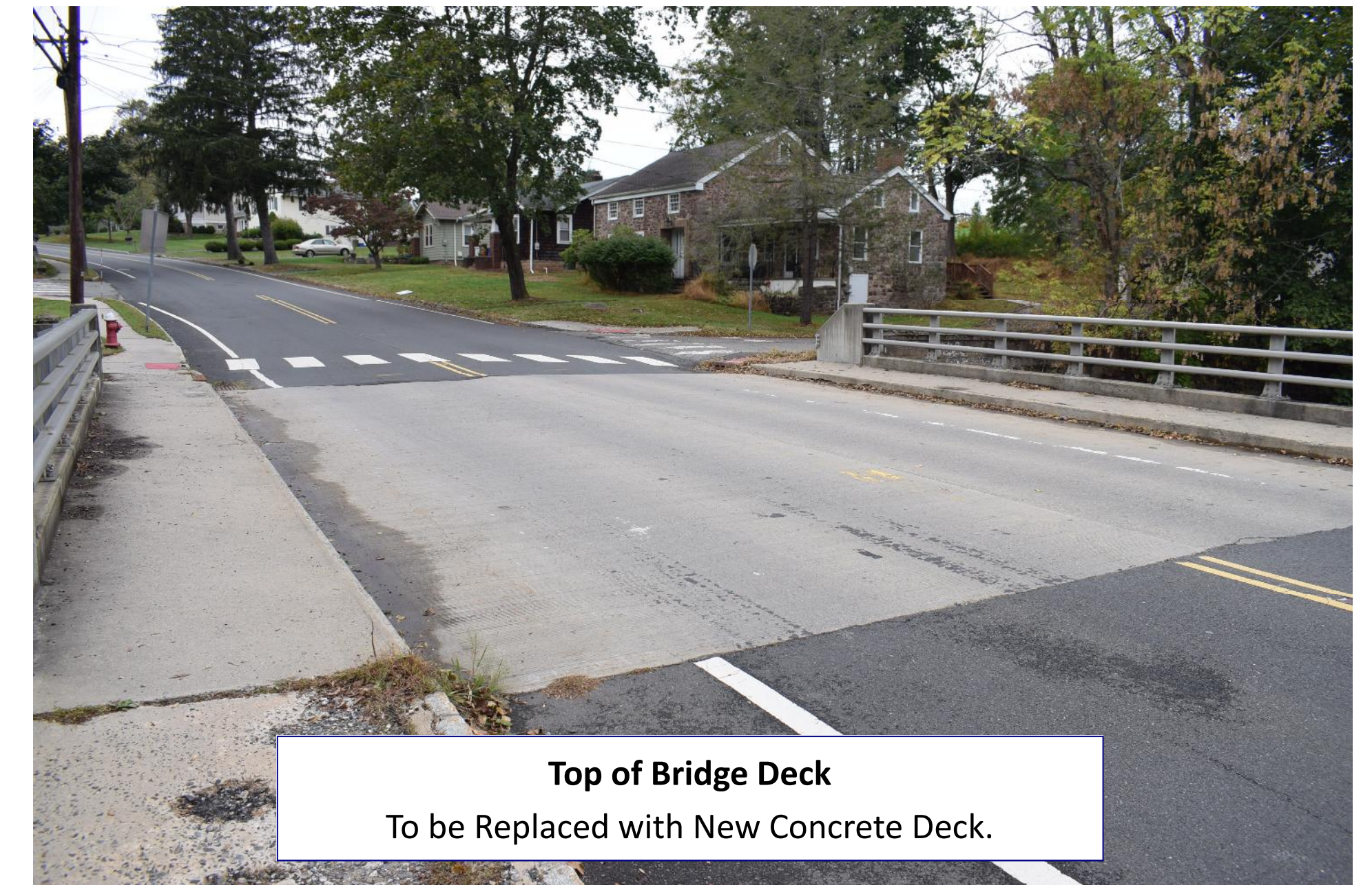
Top of Bridge Deck To be Replaced with New Concrete Deck.