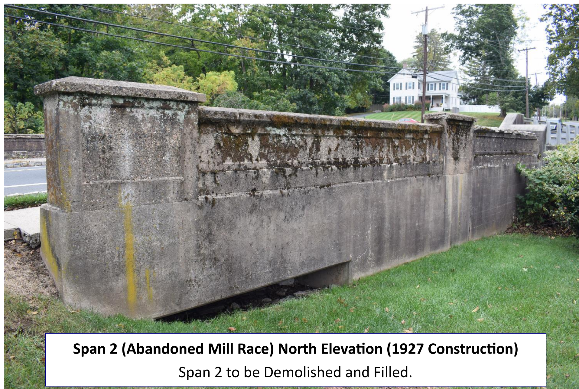
Span 2 (Abandoned Mill Race) North Elevation (1927 Construction) Span 2 to be Demolished and Filled.