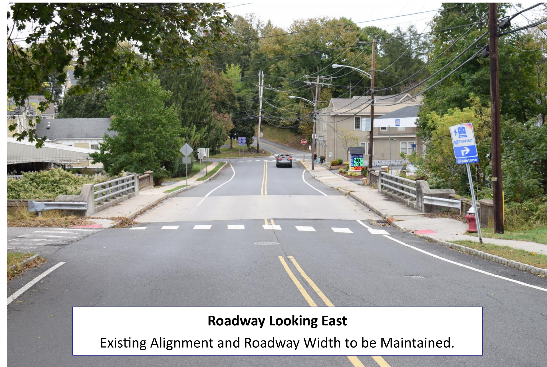
Roadway Looking East Existing Alignment and Roadway Width to be Maintained.