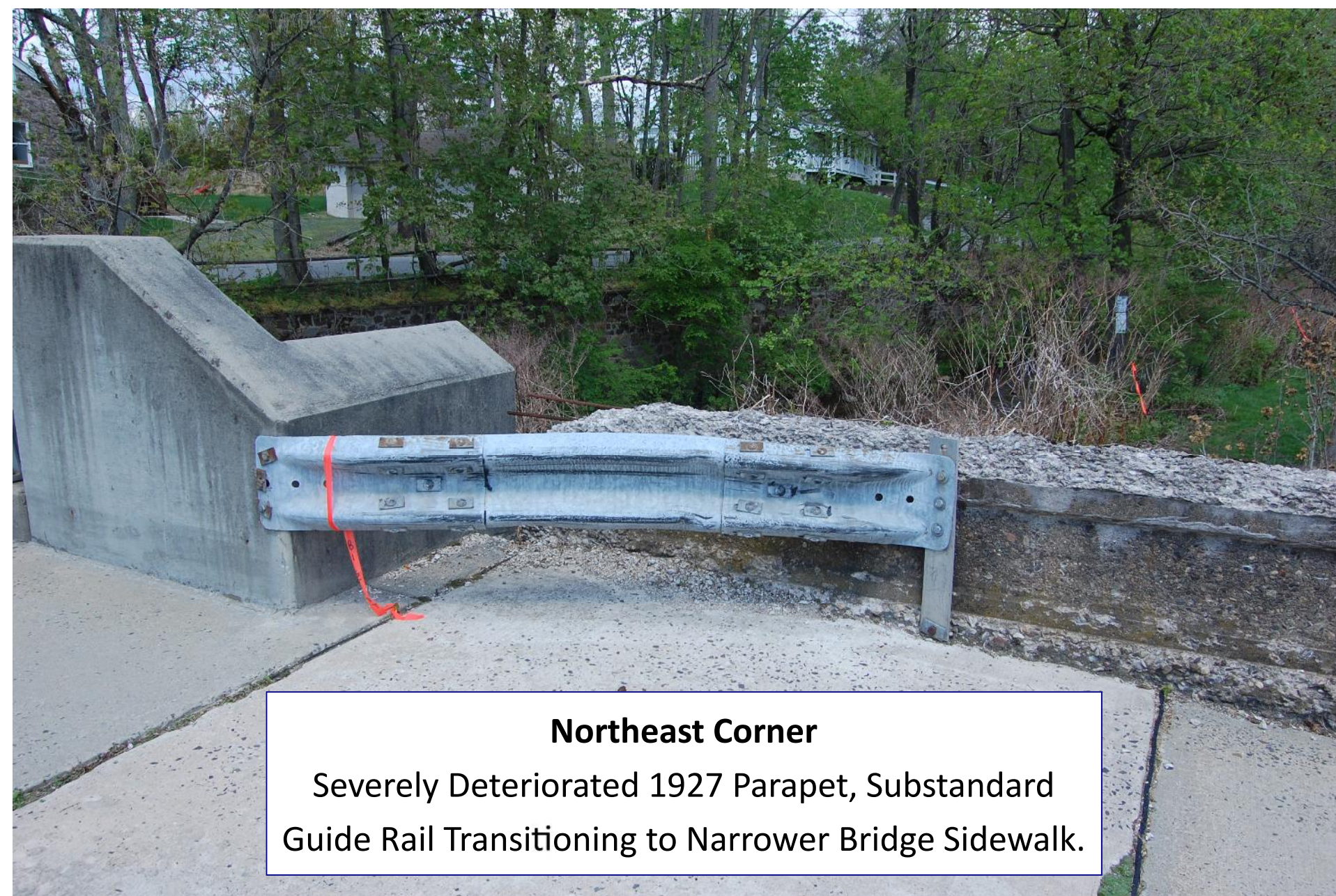
Northeast Corner Severely Deteriorated 1927 Parapet, Substandard Guide Rail Transitioning to Narrower Bridge Sidewalk.