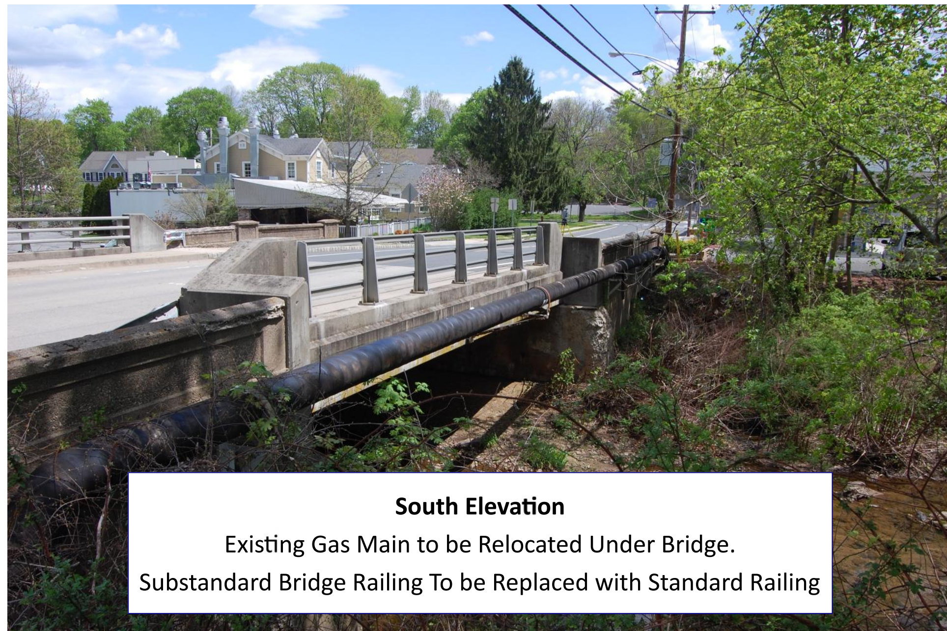
South Elevation Existing Gas Main to be Relocated Under Bridge. Substandard Bridge Railing To be Replaced with Standard Railing