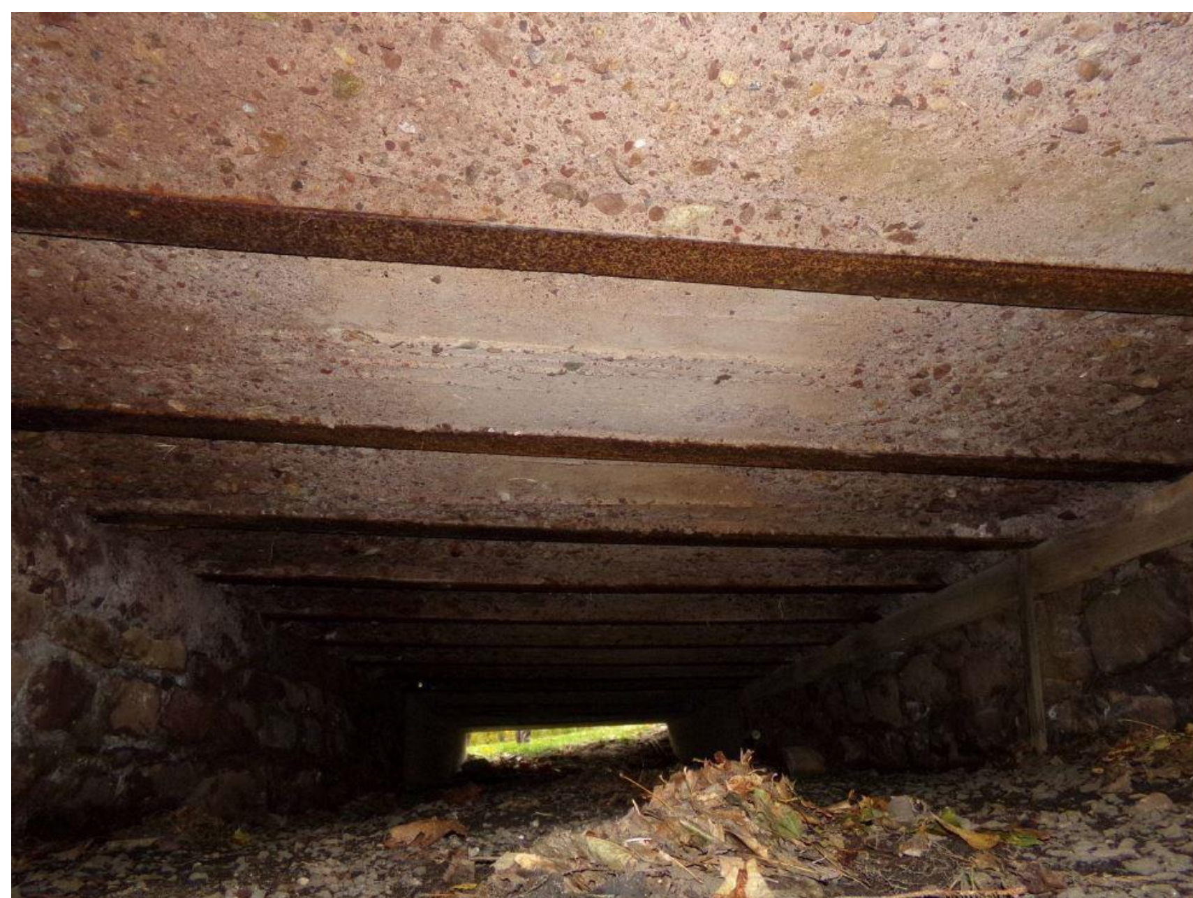
<== Span 2 (Abandoned Mill Race) Superstructure in Poor Condition due to Heavy Rusting of Steel Beams. Span 2 to be Demolished and Filled. Pre-1927 Construction.