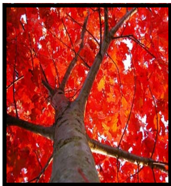
Red Oak: NJ State Tree