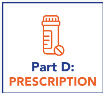
Part D: PRESCRIPTION