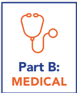
Part B: MEDICAL