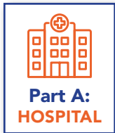
Part A: HOSPITAL